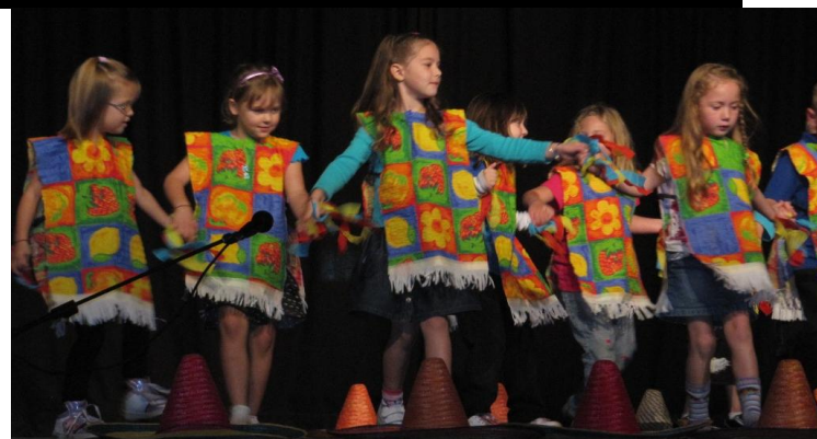
Mexican Hat Dance